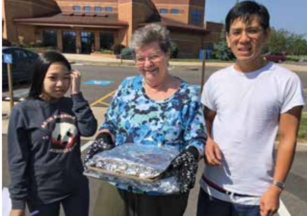
Every fourth Saturday of the month, St. Max parishioners provide dinner for the residents at Tender Mercies.

Tender Mercies was founded in 1985, with the mission of "transforming the lives of homeless adults with mental illness by providing security, dignity, and community in a place