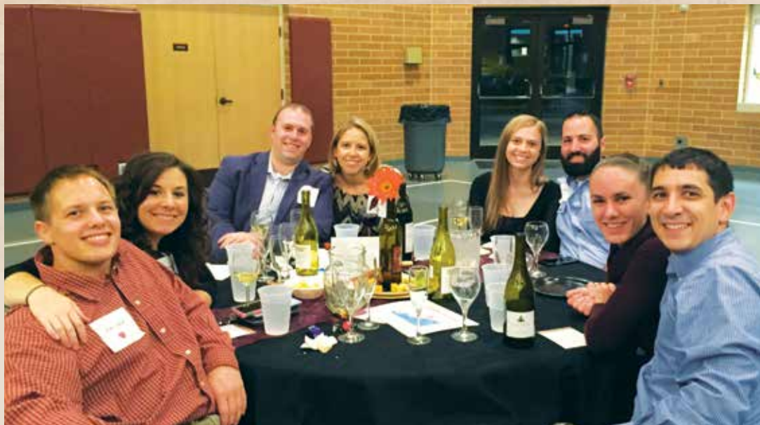
Married couples enjoying good company with one another during the annual Marriage Enrichment Wine Tasting event