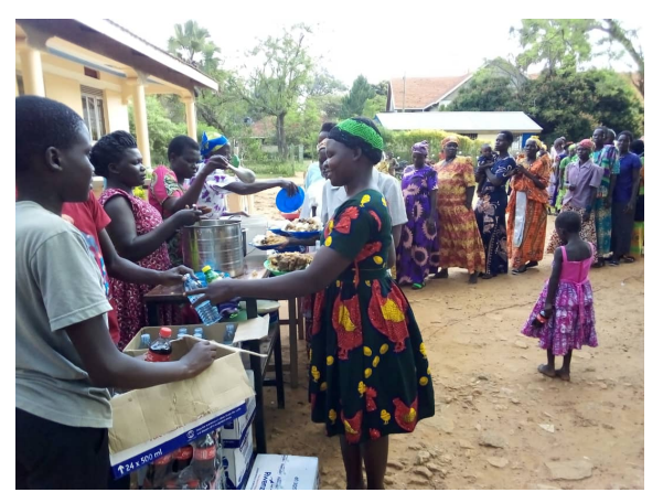
up after any Mass the weekend of March 27th.